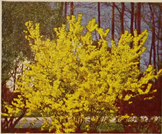
Spring Glory—The Loveliest Forsythia